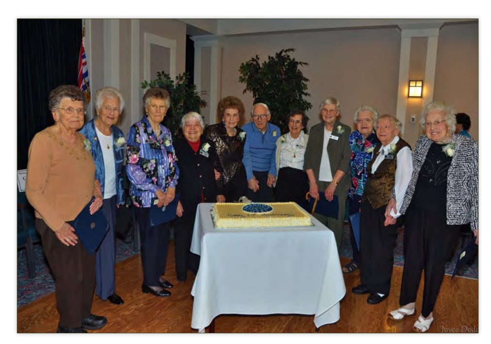
(l-r) Shannon Oaks Residents who have lived at Shannon Oaks since it opened 10 years ago are all smiles as they join in the cake cutting celebration.

Baptist Housing loves to celebrate and what better reason than an anniversary. Shannon Oaks Vancouver recently celebrated its 10th Anniversary of providing exceptional care and service to Residents. More than a seniors community, Shannon Oaks is a home - enjoyed and loved by Residents and Team Members alike. In fact, some Residents have been living there since it opened in 2001. These Charter Residents were excellent hosts of the day, proudly wearing corsages and stepping in to help cut the cake. As family, friends and partners mingled, everyone delighted in their shared experiences with Shannon Oaks. Walking through the front door there is a sign above the fireplace that says Welcome Home. For the past decade and many more decades to come, Shannon Oaks truly is home.