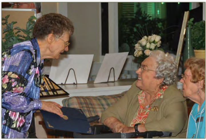
(I-r) We are looking at you - and you all look amazing. Shannon Oaks Residents enjoying each others company during the 10th Anniversary.