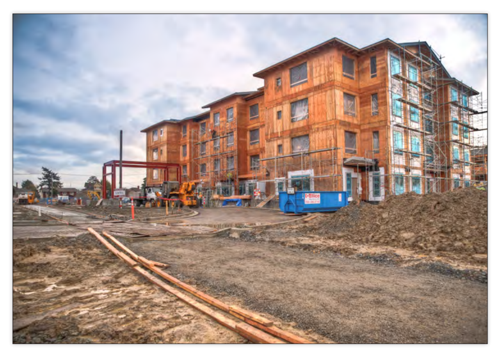
Carey Place construction proceeding well with opening scheduled for late Spring 2012.