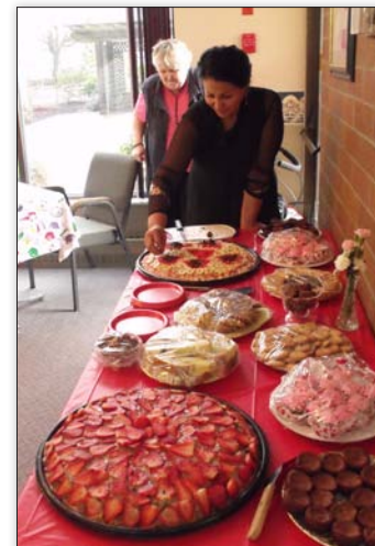
Valentine's Party - Maple Towers