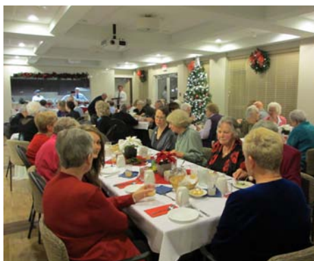
Christmas Dinner - Carey Place