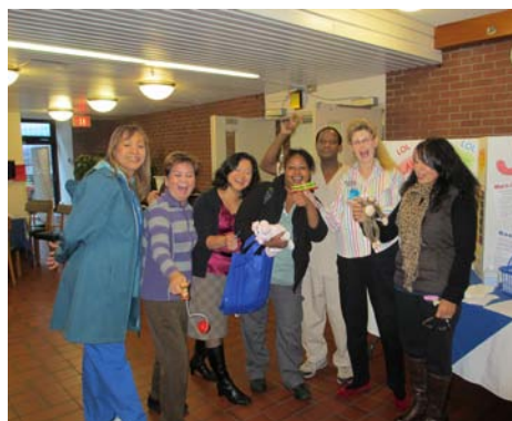
Safety Displays and Demonstrations - Central Care Home

Our Victoria Team Members recently held a Safety Week. Complete with displays and presentations, the week provided several educational opportunities for our Team and Residents. Topics included emergency preparedness, infection control, safe feeding, Gentle Persuasive Approaches dementia training, and fall prevention just to name a few. It was such a huge success, planning is already underway for next year.