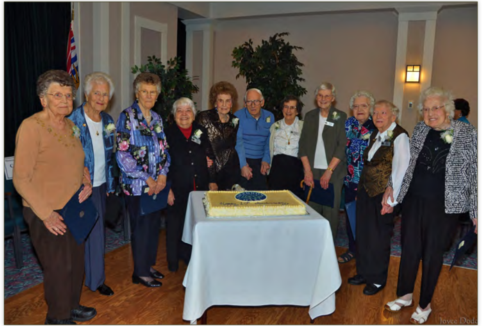
(l-r) Shannon Oaks Residents who have lived at Shannon Oaks since it opened 10 years ago are all smiles as they join in the cake cutting celebration.

Baptist Housing loves to celebrate and what better reason than an anniversary. Shannon Oaks Vancouver recently celebrated its 10th Anniversary of providing exceptional care and service to Residents. More than a seniors community, Shannon Oaks is a home - enjoyed and loved by Residents and Team Members alike. In fact, some Residents have been living there since it opened in 2001. These Charter Residents were excellent hosts of the day, proudly wearing corsages and stepping in to help cut the cake. As family, friends and partners mingled, everyone delighted in their shared experiences with Shannon Oaks. Walking through the front door there is a sign above the fireplace that says Welcome Home . For the past decade and many more decades to come, Shannon Oaks truly is home.●