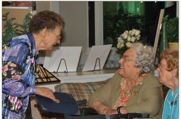
(l-r) We are looking at you - and you all look amazing. Shannon Oaks Residents enjoying each others company during the 10th Anniversary.