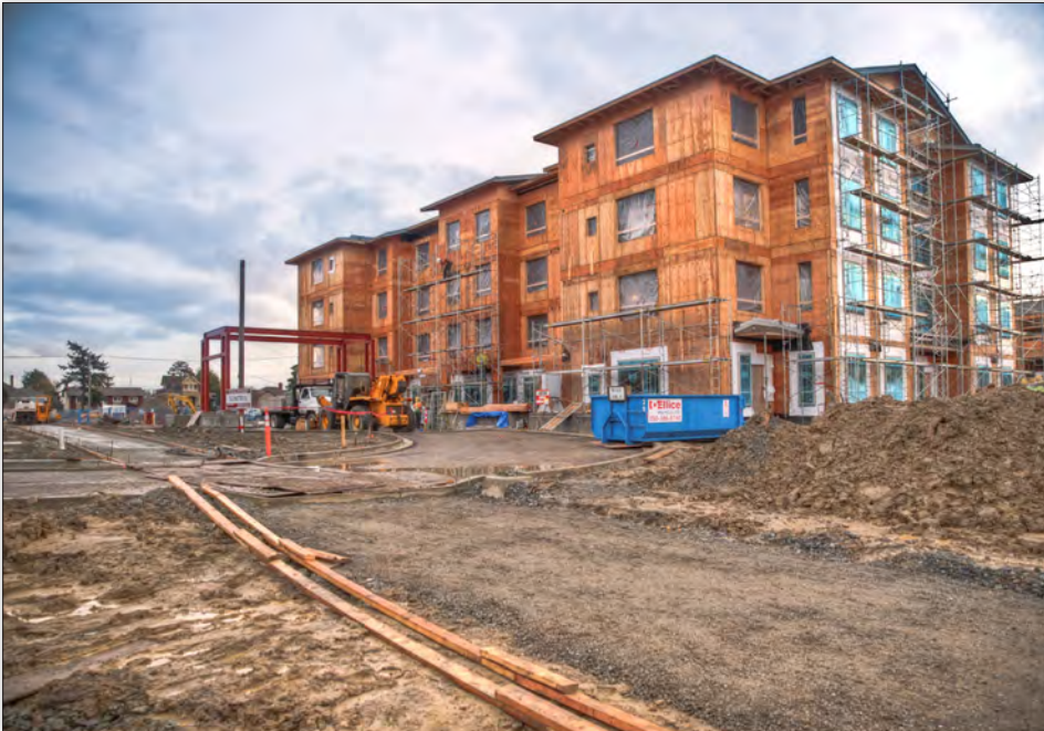
Carey Place construction proceeding well with opening scheduled for late Spring 2012.