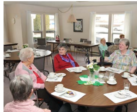
Residents at Green Valley Estates enjoy a special birthday tea - there may be snow outside but inside its all warmth and smiles.

Celebrations are ultimately about building community and providing opportunities for people to develop friendships and connect with each other.●