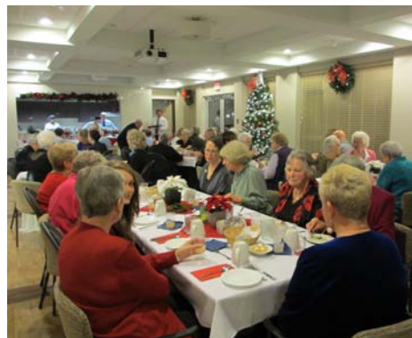
Christmas Dinner - Carey Place