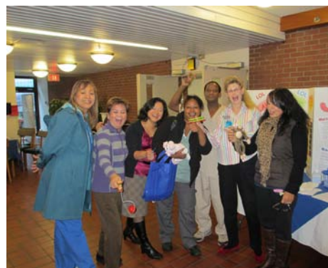
Safety Displays and Demonstrations - Central Care Home

Our Victoria Team Members recently held a Safety Week. Complete with displays and presentations, the week provided several educational opportunities for our Team and Residents. Topics included emergency preparedness, infection control, safe feeding, Gentle Persuasive Approaches dementia training, and fall prevention just to name a few. It was such a huge success, planning is already underway for next year.