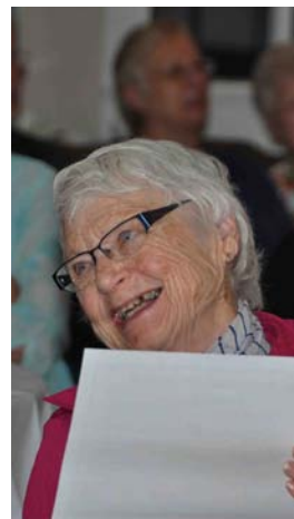
(l-r) Resident Appreciation Events at Grandview Towers and Shannon Oaks Vancouver