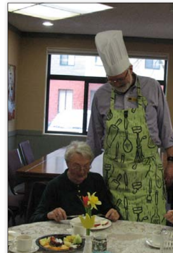
Birthday Tea - Marrion Village